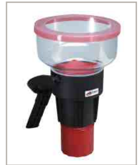
Solo 332 Aerosol Dispenser for larger diameter detectors.

The Solo 332 is available for detectors with larger bases.