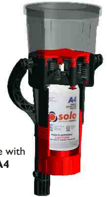
For use with Solo A4

The Solo 332 is available for detectors with larger bases.