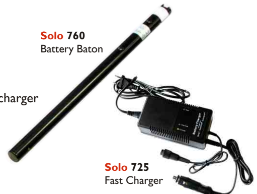
Solo 725 Fast Charger